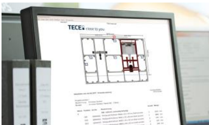
2. Planning with TECESmartwall