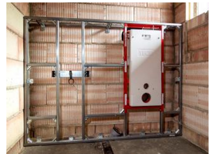
5. Assembled pre-wall, ready for panelling and tiling.