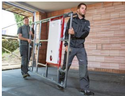
4. Delivery of the finished installation wall at the construction site