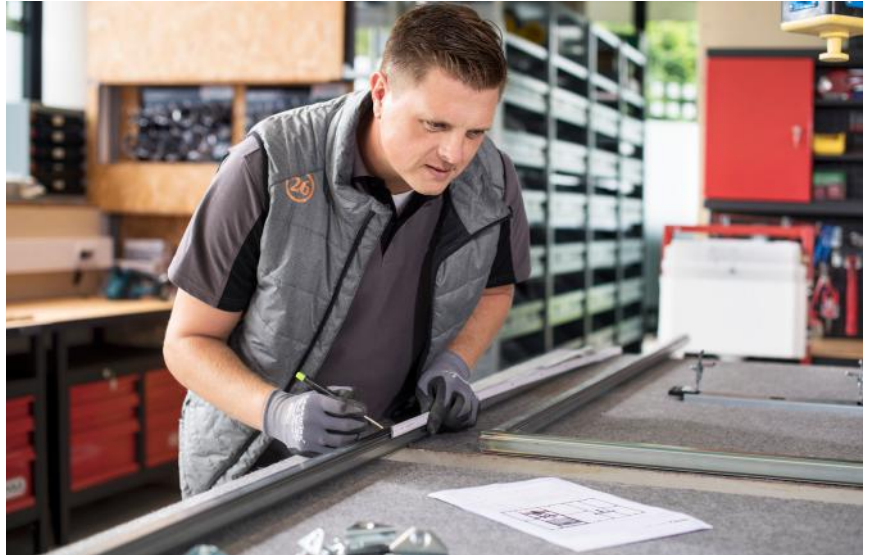
3. Prefabrication in the workshop