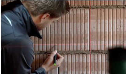
1. Measurement on the construction site

In an economical evaluation, pre-fabrication leads to a reduction of travel expenses and travel time and thus to greater efficiency in everyday work. Even the building client will welcome this mode of assembly because the construction process on the construction site is optimised – no matter whether it's a new building or renovation.